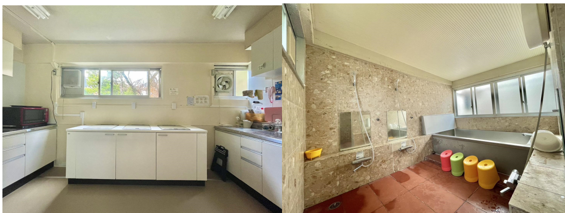
( Kitchen and Bathroom )

There is also a secret ladder to the rooftop on the veranda between the kitchen and bath. You can see the stars very beautifully at night.