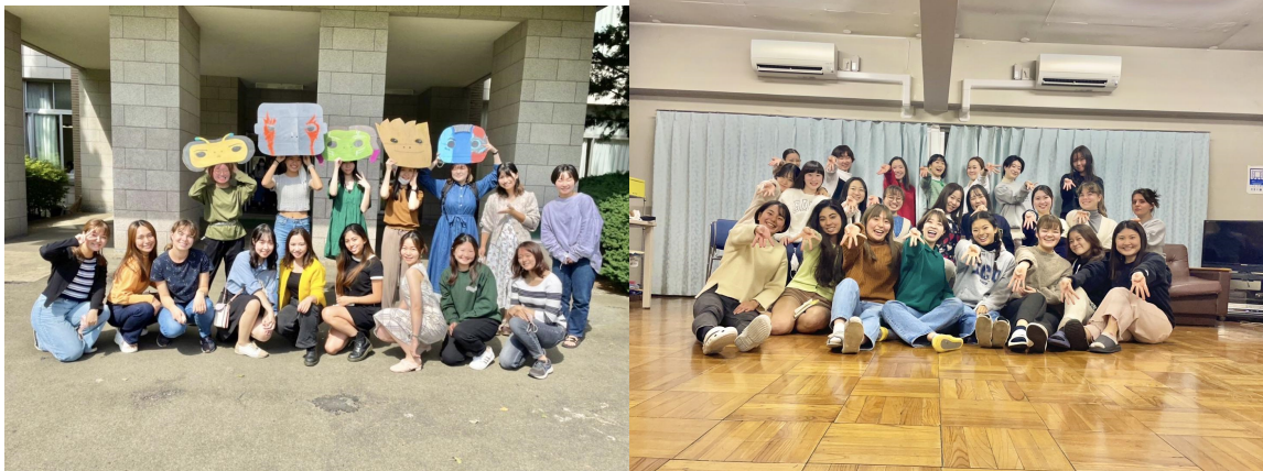
( 4WD members )

I am writing this article hoping that you will get to know my 4WD as much as possible. Please enjoy reading ;)