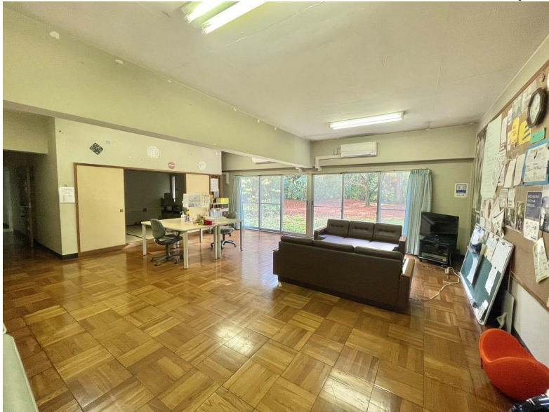
( Social Room )

Study Room: This is a room for studying. Since it is located at the end of the first floor, it is quiet, and you can concentrate on your assignments when you have a lot of work to do. It can also be reserved for interviews and internships.