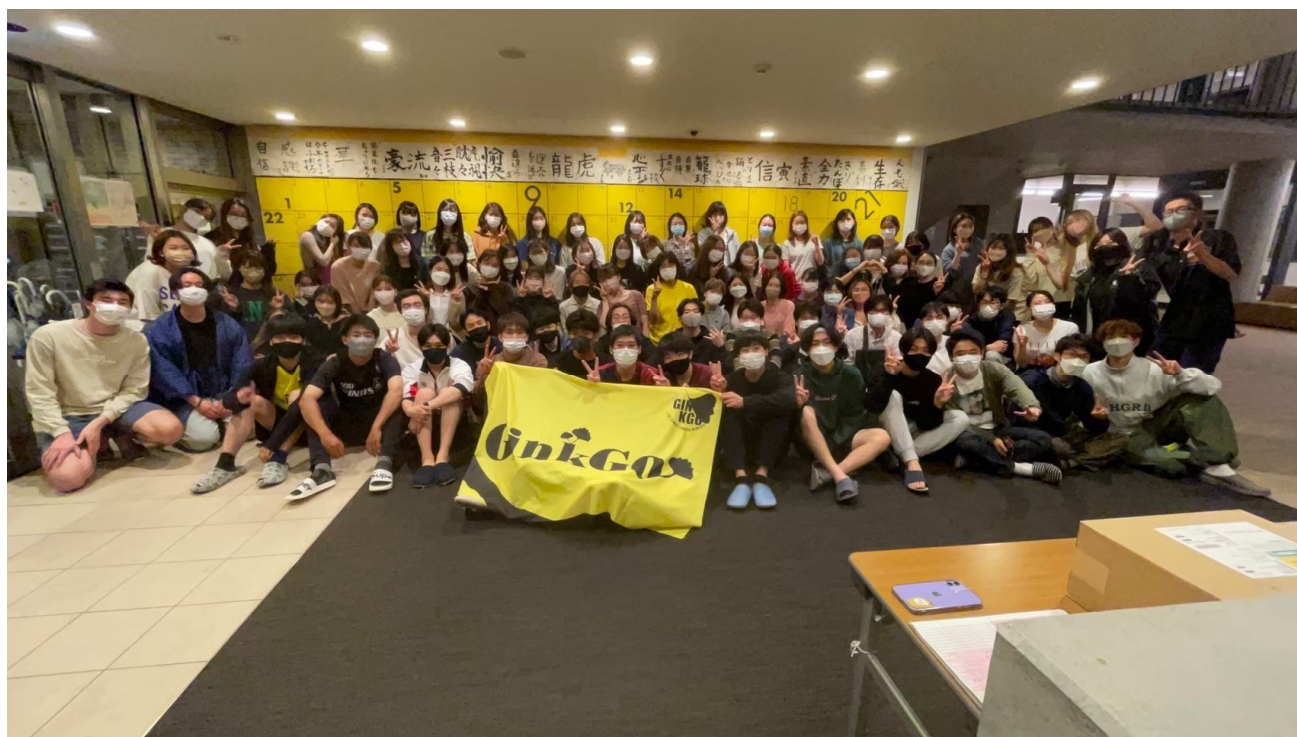
All Residents of Ginkgo Dorm