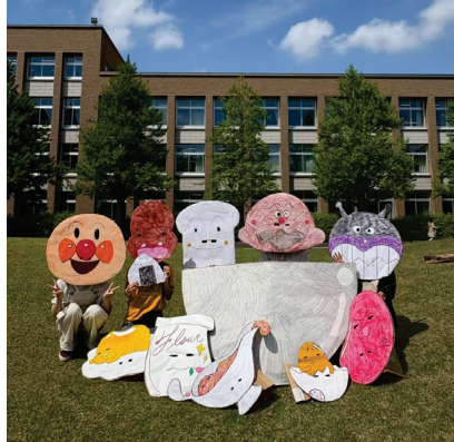
New Student Initiation